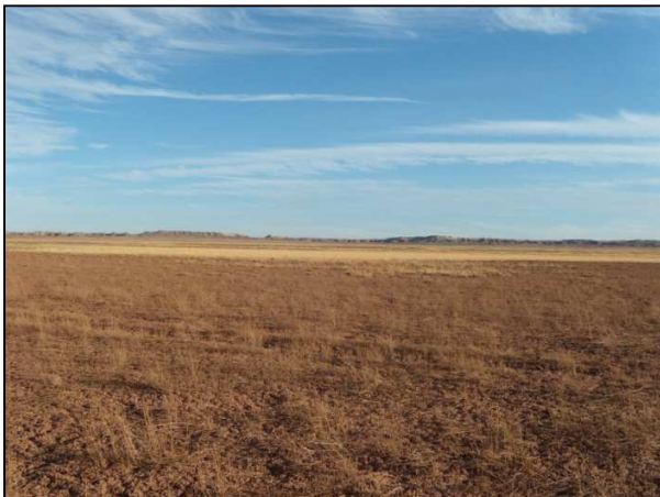
Rangeland on north end of ranch, State & Private Lease.