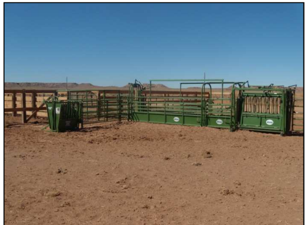
Squeeze chute, calf table and alley on deeded.