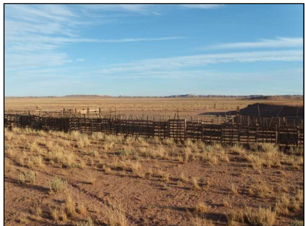
Corrals at Twin Tanks on State Lease.

Disclaimer: This information was obtained from sources deemed to be reliable but is not guaranteed by the Broker. Prospective buyers should check all the facts to their satisfaction. The property is subject to prior sale, price change, or withdrawal.