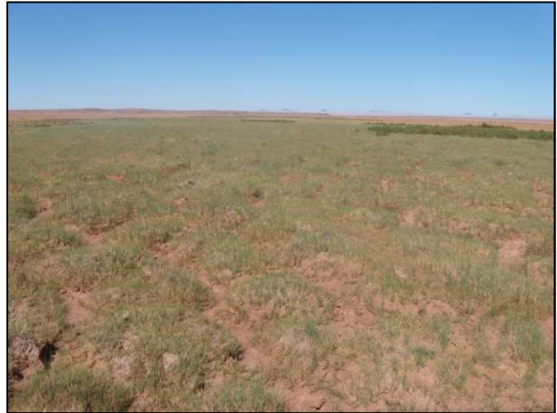
Sacaton grass on Tucker Flat, State & Private Lease.