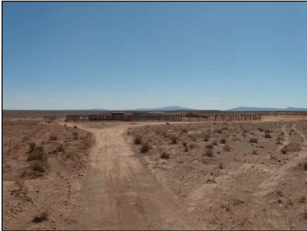
Corrals on deeded land.