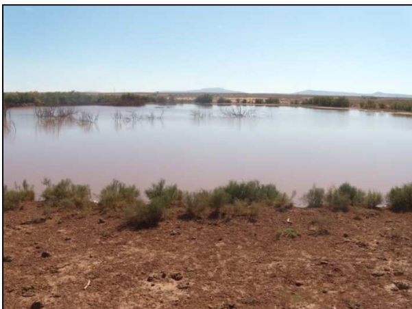
Tucker Flat Wash Tank on State Lease.